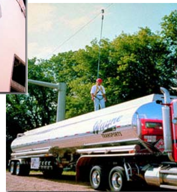
Ray will talk about both portable and fixed fall protection equipment during his presentation.