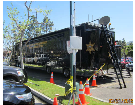
2.4-GHz Ubiquiti NanoStation and 5-GHz Ubiquiti Rocket with dual-channel flat-panel antenna at OCSD's Samantha I receiving video streams from two strings of ipCams.

RACES members are developing their skill