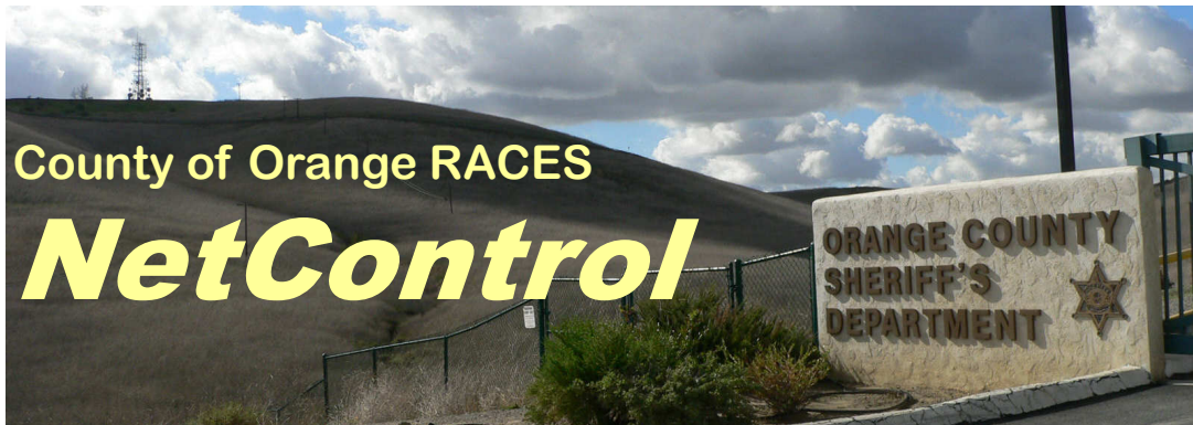
Newsletter of the County of Orange Radio Amateur Civil Emergency Service